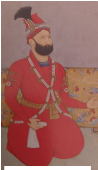
NADAR SHAH Shah of Persia,

An orthodox Sunni Muslim, he reinstated taxes and laws penalizing Hindus and imposing Sharia law. In addition, thousands of Hindu temples, and shrines were often destroyed. His falling out with his own Rajput army shatters and the Mughals begin to disintegrate.