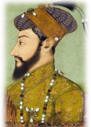
AURANGZEB Mogul Emperor

Without the capital the empire burns out, shatters, fragments, and goes into decline.