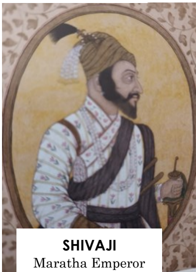
SHIVAJI Maratha Emperor

The Marathas rise spreading out, marauding, burning villages, and adopting a scorched earth policy, the year 1719 atrocities took place.